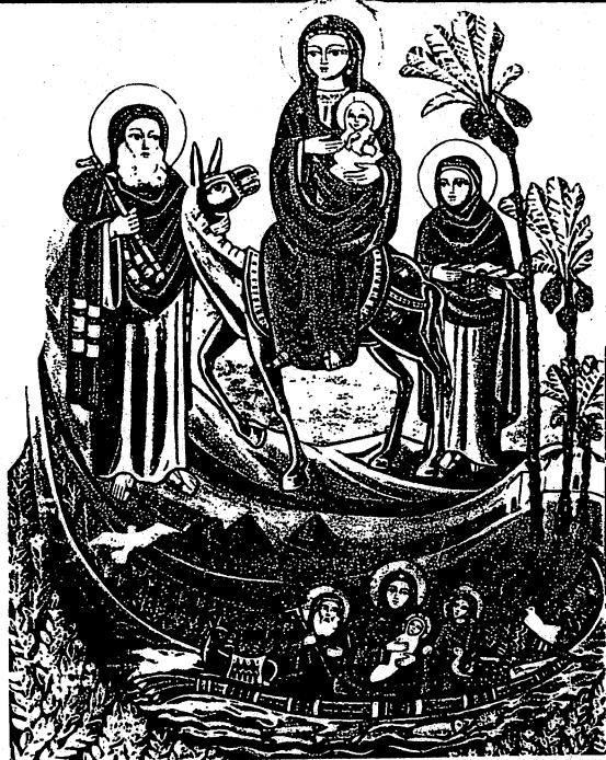
AND HIS MOTHER AND DEPARTED FOR EGYPT.”