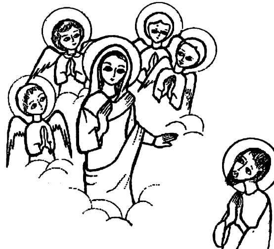
Thomas saw St. Mary's body ascending to heaven.

✦ St. Mary is the perfect example of the redeemed humanity. She was brought to heaven in the glorified body as a sign to the faithful, of what awaits all who live and die in the Lord. Our church celebrates the feast of her glorious assumption to heaven on Misrah 16th (August 22nd).