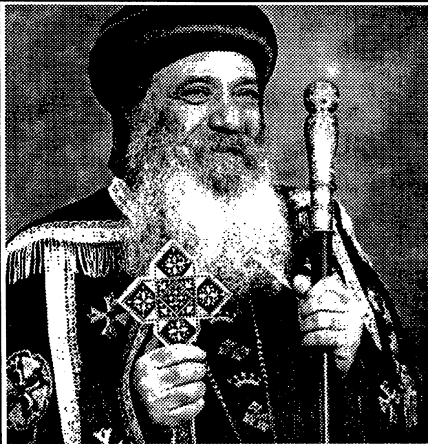
Pope Shenouda III Pope of Alexandria and Patriarch of the See of St. Mark the Evangelist

DREAMS COMING TRUE During the blessed reign of H.H. Pope Shenouda III