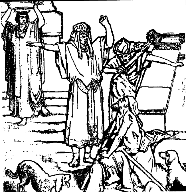
This rich man, feasted in luxury, looked at his fellow-man, poor Lazarus, hungry and in pain, and did nothing about it. Such is the scene in this world nowadays. (Luke 16:19-31)