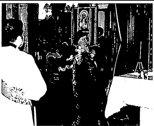
Upon reaching the altar, H.H. offered Thanksgiving prayer.