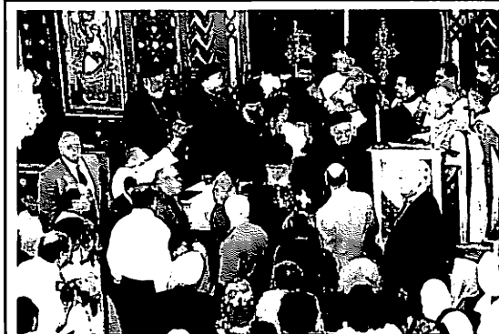
On his way out of the Church, H.H. the Pope put his hand on the sick and prayed for their speedy recovery.