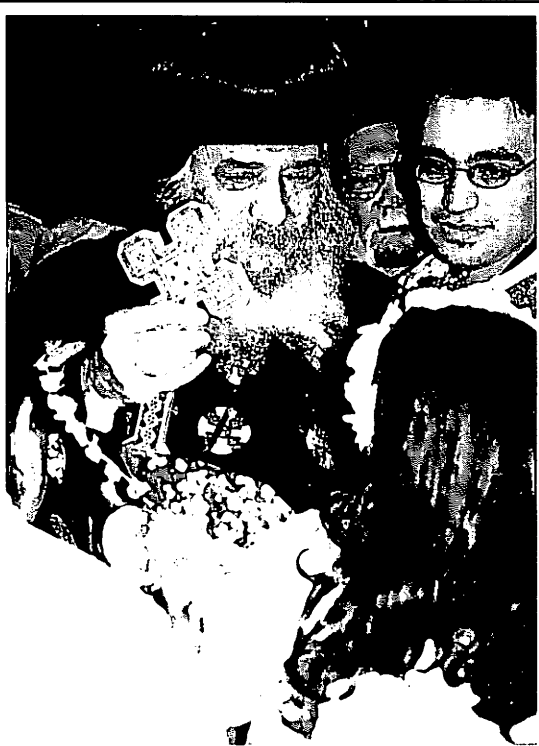
Just before reaching the sanctuary, a little girl presented H.H. with flowers.