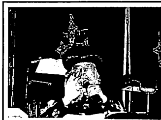
H.H. delivering a sermon about “the Power of His Resurrection” after which he congratulated the congregation, for building such a beautiful church, and answered their questions.